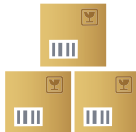
MRO and Asset Management