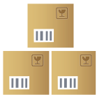
MRO and Asset Management